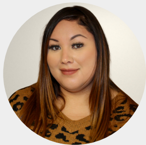
Esmeralda Enhance Advocate South Sioux City